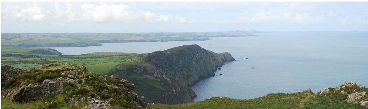
Penbwchdy from Garn Fawr